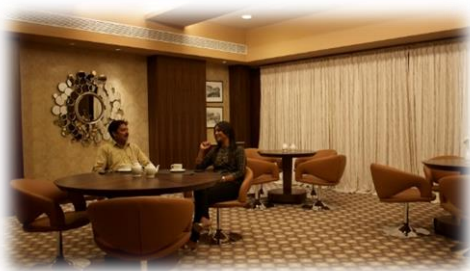
Club Opal, Chennai, India