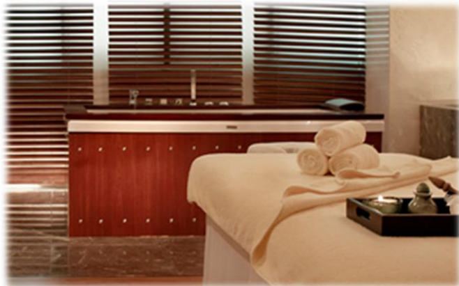
The Westin Tianjin