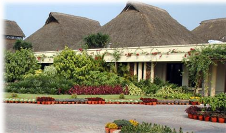
Vedic Village Spa Resort, Kolkata