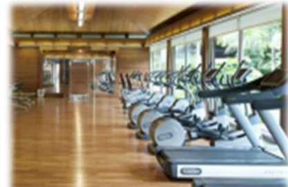
Mandarin Oriental, Sanya

International Leisure Consultants (ILC) is a specialized Consultancy and Management company with extensive experience in the leisure industry. Throughout the Asia Pacific Region, ILC have worked on some of the finest membership clubs and hotel spas in the region, providing services from concept and feasibility studies, technical assistance and pre-opening services.